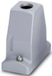
HEAVYCON ADVANCE EMV sleeve housing B10, with screw locking, height 100 mm, with 1x M25 thread, straight cable outlet

Please be informed that the data shown in this PDF Document is generated from our Online Catalog. Please find the complete data in the user's documentation. Our General Terms of Use for Downloads are valid ( http://download.phoenixcontact.com )